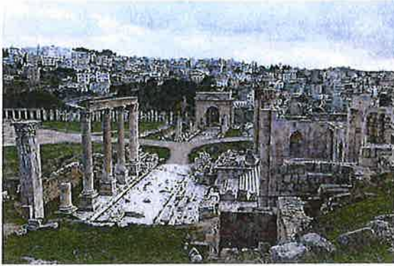
Amman Citadel ruins