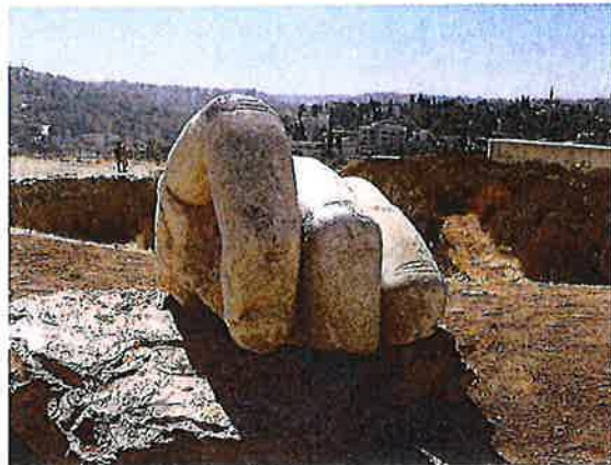
Hand of Hercules