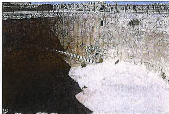
Umayyad water cistern

Coordinates: 31°57'17"N 35°56'03"E / 31.9547°N 35.9343°E The Amman Citadel is a historical site at the center of downtown Amman, Jordan. Known in Arabic as Jabal al-Qal'a , (القلعة الحصينة), the L-shaped hill